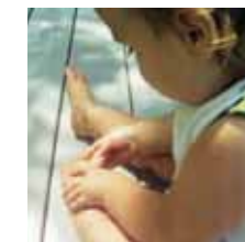
VEKAdeck™ surface remains cool and splinter free.