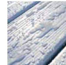
Impervious to salt water and chlorine make VEKAdeck an ideal material for marine applications.