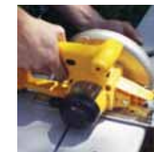
VEKAdeck™ can be worked with traditional hand or power tools.